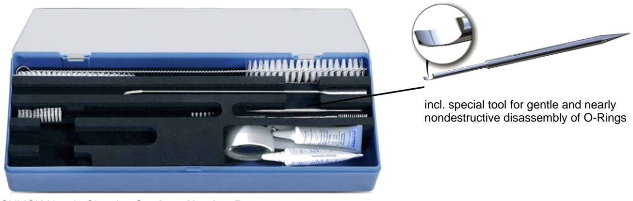
SCHLICK-Nozzle Cleaning Set; Item-Number 53066-2

Lubricant OKS 250; Item-Number 54249 (up to 1400°C / 2550°F)