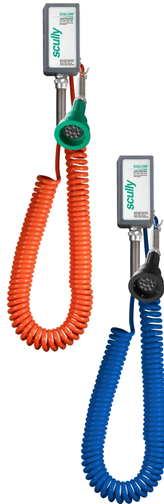
Intellitrol®2 Overfill Prevention Control Unit