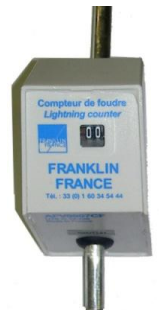
Lightning counter AFV0907CF