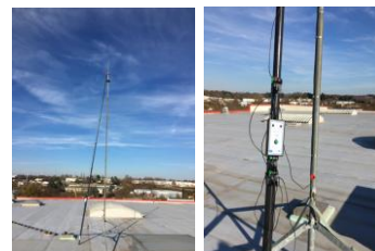
Telescopic perch AFV0087PT